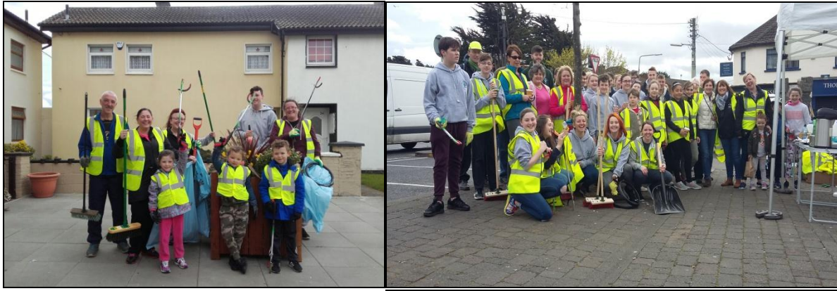
Residents from Doon Court, Ballymun and participants in Finglas Village taking part in the recent Team Dublin Clean Up event